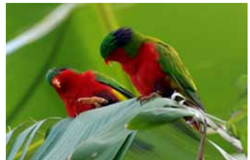
Kura , a native lorikeet which was lost and reintroduced from Rimatara in 2007