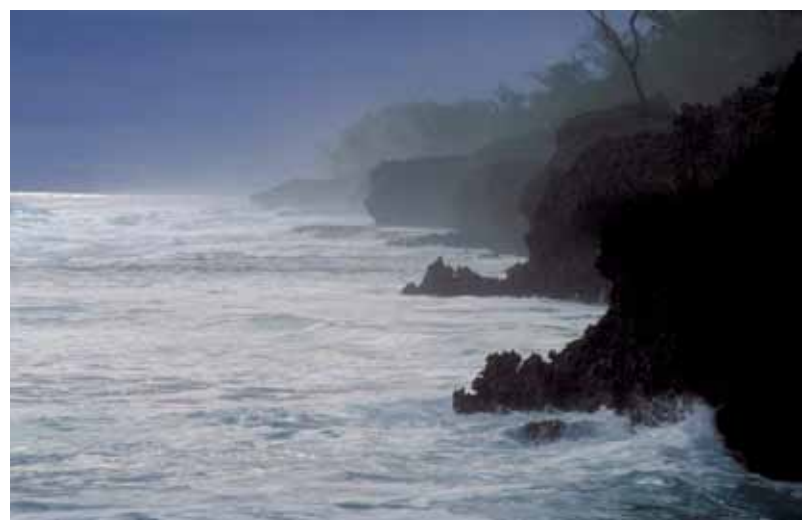
Vai Piake Landing, Atiu