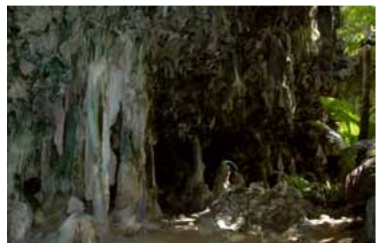
The Kopeka cave, Aitiu