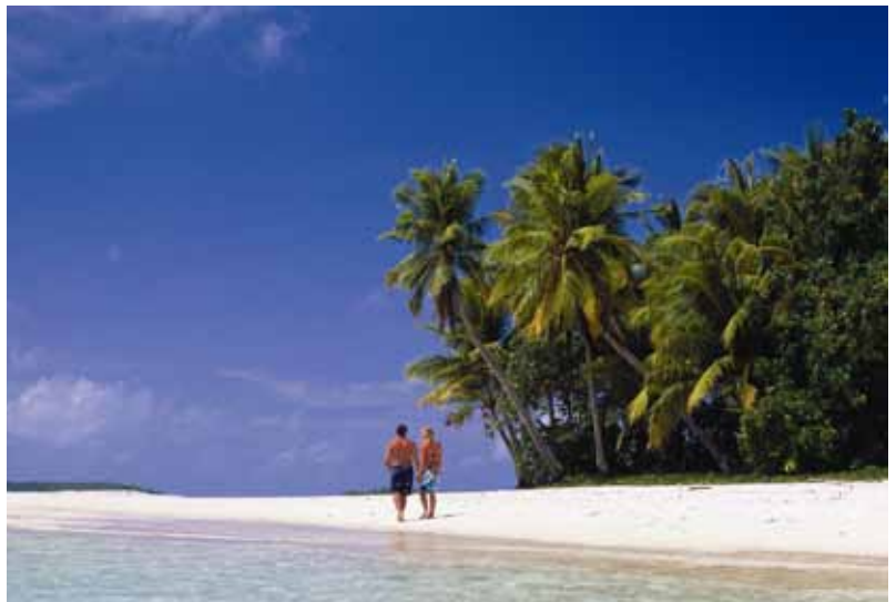
On Motu Tapu'aetai, Aitutaki