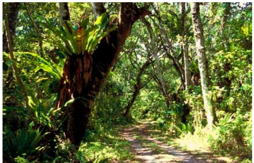
West coast road in Atiu