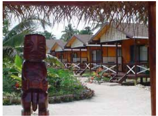
Samade hotel in Aitutaki