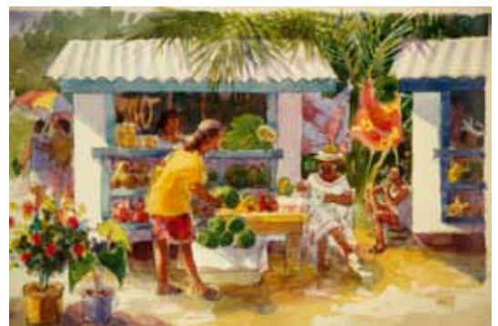
Market on Saturday morning, Rarotonga