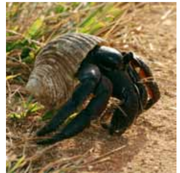
Chocolate Hermitcrab, a native of the Cook Islands.