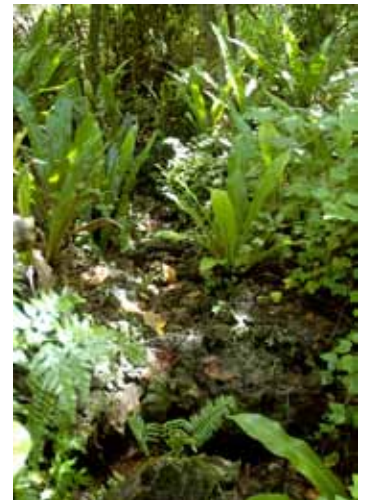
Rainforest and Makatea in Aitiu