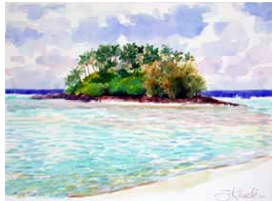
Reef-islet Ta'akoka in Muri, Rarotonga